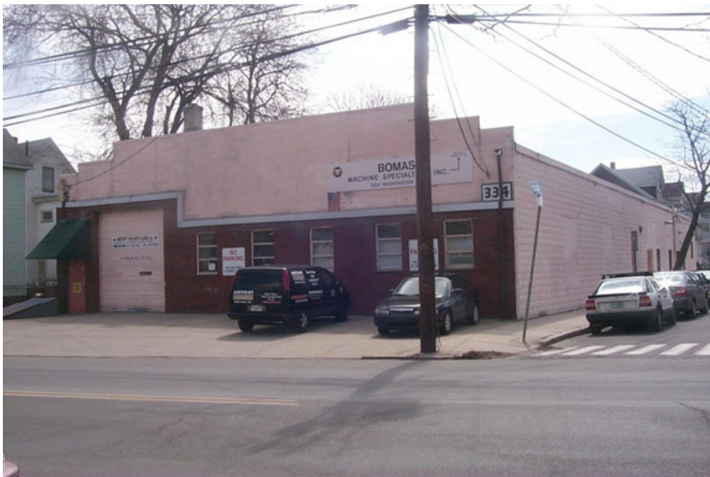
Current site conditions